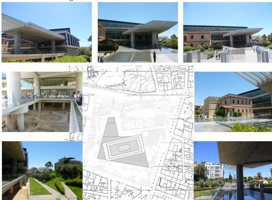
Figure 7. Akropolis Museum's Open Spaces (Plan, URL-7).

The entrance level of the building is detailed for disabled access