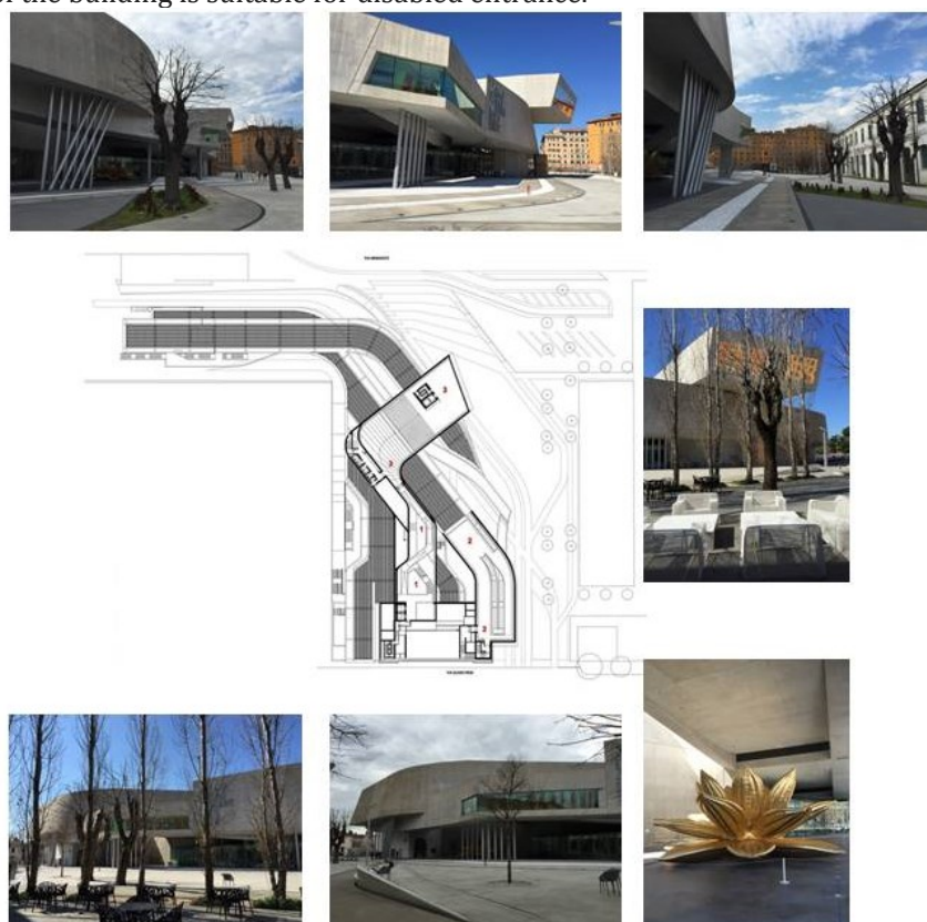
Figure 8. MAXXI Museum's Open Spaces (Plan, URL-8).

The entrance level of the building is suitable for disabled entrance.