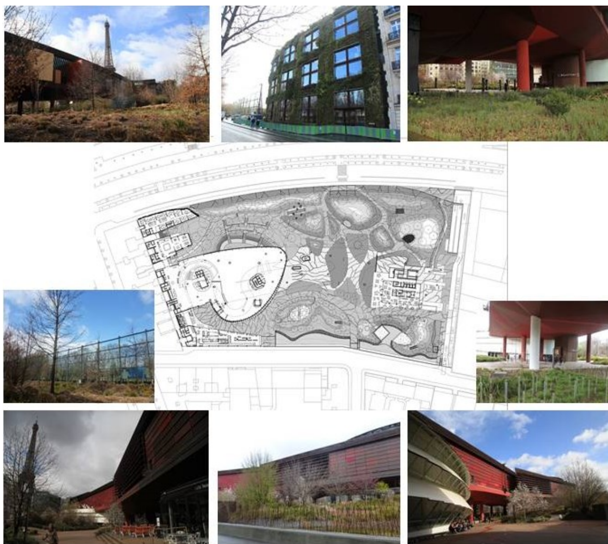
Figure 6. Quai Branly Museum's Open Spaces (Plan, URL-5).

The entrance level of the building is located on the road level. In the transition from the sidewalk to the museum garden, disabled access is detailed.