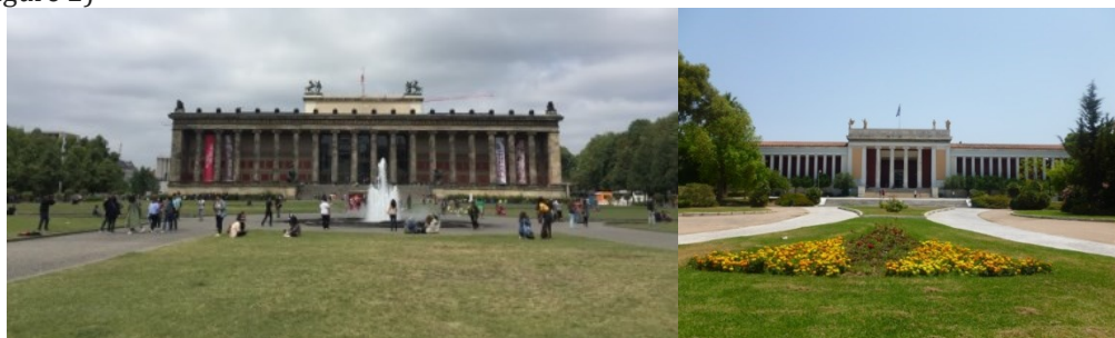
Figure 2. Altes Museum, Athens National Museum.