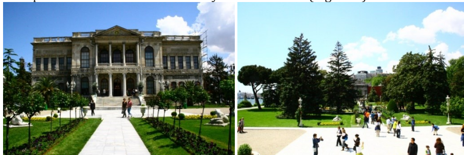
Figure 1. Dolmabahçe Palace and garden (Photos: Ataoğlu, 2012).

Palace museums are important that display of qualified historical items its inside and they contain in terms of period features. The open areas of these buildings also exhibit period features. In this meaning, there is cultural and historical value of the palaces and museums in Turkey and the world. (Figure 1)