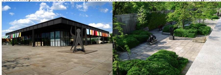
Figure 3. New National Gallery, Mies van der Rohe, Berlin, 1962-1968 (URL-2).

The New National Gallery, designed by Mies van der Rohe in Berlin, has influenced the 20th century museums with its transparency. The transparent museum integrates with the sculpture exhibition in its garden. (Figure 3)